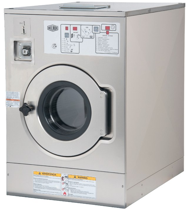
35 lb. capacity model MCT16E5

The microprocessor identifies certain error codes, which may be corrected by attendant (saving downtime). The formula load count accumulator provides a running count for each of the seven formulas, allowing greater reporting to the store owner/manager. Milnor's microprocessor control delivers two sets of seven wash formulas, each with programmable vend prices. The first set features standard formulas ranging from a Quick Wash to a Heavy Soil option. The second set of seven formulas uses Milnor's GreenTurn™ programming decisions, featuring fewer rinses, less hot water use and faster processing times. Either formula set can be selected by the store owner.