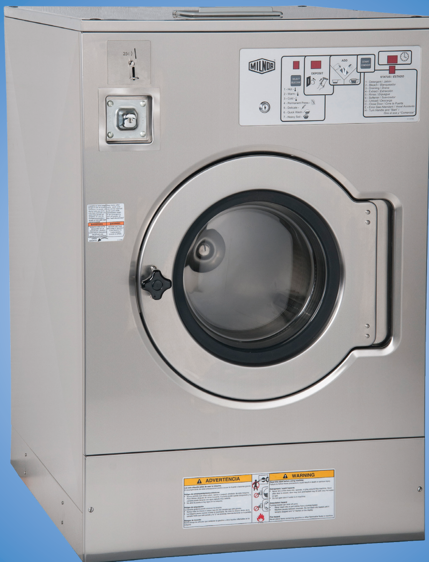
45 lb. capacity model MCT18E4

QUALITY, VALUE, DURABILITY ■ FIVE CAPACITIES ■ EASY-TO-USE CONTROLS